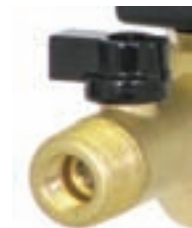
Dual inlet design

* For other requests/specifications please see FLUIDRAIN or EZ1 ranges.