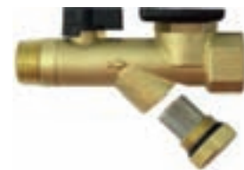
Integrated strainer with filter