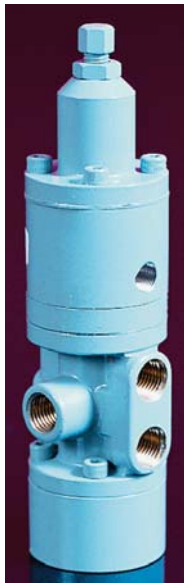
GVB11 / GVB12 Series