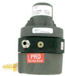
High Pressure - Natural Gas Regulator