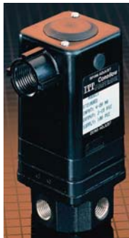
GT210/GT410/ GT610 Series